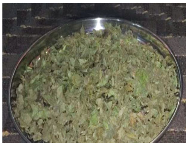
Fig. 1 L. inermis (Henna) leaves which were collected from private gardens in the city of Basra in the southern part of Iraq.

The mean diameters of the inhibition zones on Gram-positive bacteria isolates were measured in (mm) and the results were recorded, Table 1. The zone of inhibition indicated by the effect of L. inermis leaves against tested pathogenic bacteria is demonstrated in Figure 2.